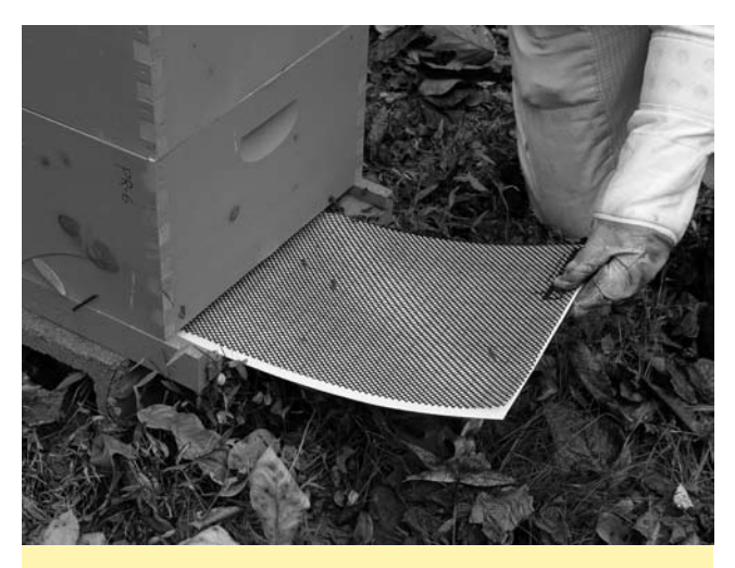
Figure 3. The sticky board method for estimating mite load. N.C. State Apicultural Program