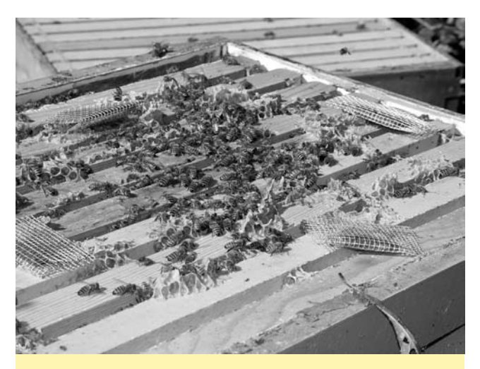
Figure 4. Apilife VAR. N.C. State Apicultural Program

gest a more moderate level of control. This method requires significant time, labor, and hive manipulation, making it difficult to use in large-scale beekeeping operations. Nonetheless, it is a good alternative to other control methods that are either less effective or that utilize more stringent pesticides, particularly when dealing with only a few hives.